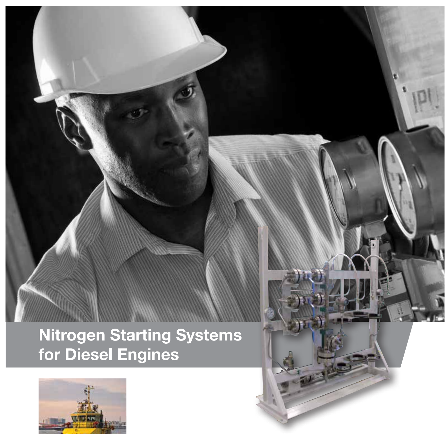
Suitable for starting engines up to 320 litres in hazardous areas Compact solution using interchangeable gas bottles